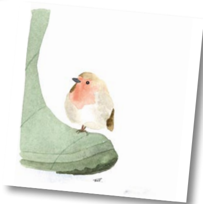
'Robin' by Tim Richardson Greeting 'Happy Christmas' £4 for 10 cards Size 150mm x 150mm (Square)