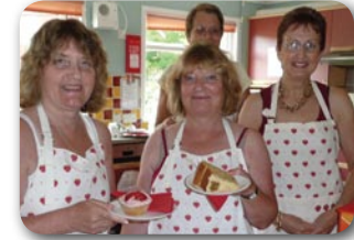
Cakes galore & simply scrumptious!