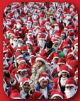
Has anyone seen Santa?