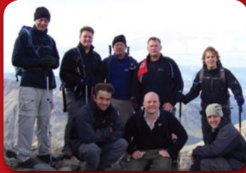
The triumphant team, well done lads