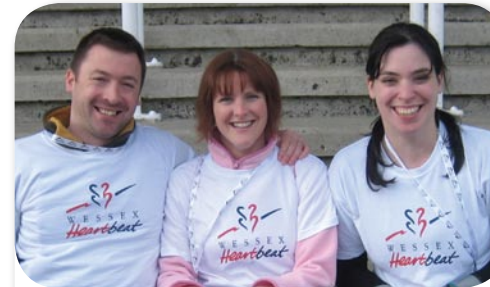
Some of the 'Just Walkers'

The lovely ladies of Ferndown Inner Wheel group made a donation of £250 to WHB. Our thanks to everyone in the group; support from community groups such as yours is invaluable to us and it is greatly appreciated.